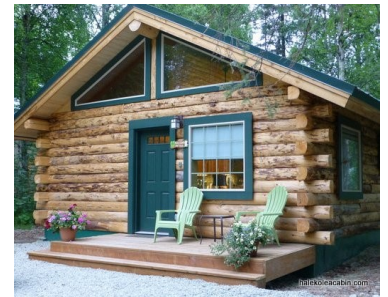
Hale Kōlea Cabin: a 15-minute walk from historic Downtown Talkeetna

Our Sumer Peak-Season rates (June through August) are: $215/night or $1,330/week. Our Winter Off-Peak rates (October through April) are: $145/night or $875/week. Rates for May & Sept. are: $195/night or $1,190/week.